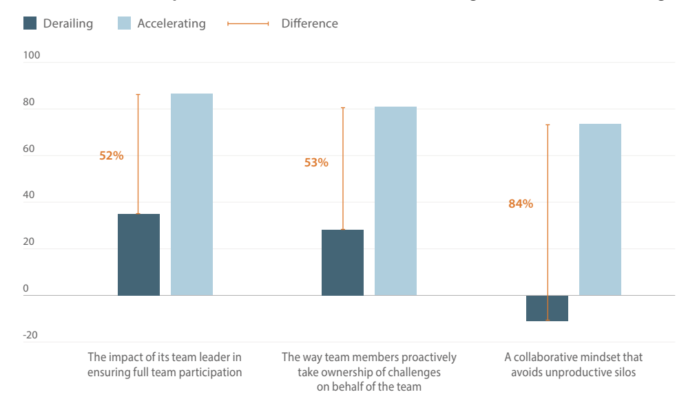
Distributed leadership seems to be foundational—but mastering it seems to be a mixed bag

Distributed leadership ensures the full participation of all team members and fosters a collaborative and proactive team mindset along with an inclusive culture that encourages people to feel free to share perspectives and concerns on behalf of the team. Such an environment is more likely to encourage team members to truly align on a shared purpose and is essential in establishing an effective, disciplined decision-making process. There is a wide spectrum of team leadership culture, from the authoritative, where one person makes decisions, to consultative, where the leader asks for advice and creates space for debate, to challenging, where decision making is fully shared by the team. Most teams sit somewhere in the middle of this spectrum and have a consultative style, where the leader factors in the opinions and advice of his or her team members and then makes a call. Any team can shift into an authoritative mode in the case of a crisis like COVID-19 and revert to their default dynamic as the crisis recedes, as long as they know what kind of leadership they want.